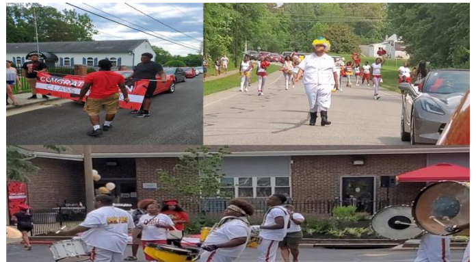
AAC Branch NAACP participated in the Freetown Village Graduation Parade to celebrate the Class of 2020

prom and graduation. Many students and community members expressed that since they were not able to participate in a formal graduation, they were happy the parade made up for the event. The AAC Branch NAACP was able to honor approximately twenty (20) graduates and offer them words of encouragement as they embarked on their next steps in life. They were also awarded with certificates to celebrate this pivotal accomplishment.