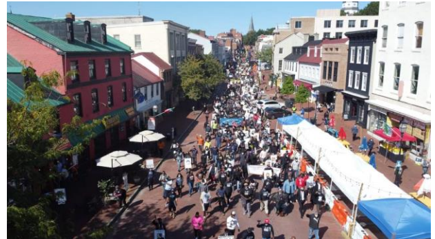
September 19, 2020 – 1000 Man March, Annapolis, MD

The system failed us again. But we are not done protesting. We co-sponsored the 1000 Man March of Annapolis on Saturday, September 19, 2020.