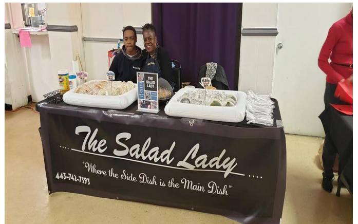
Pictured above, the vendor, The Salad Lady participating in event.

The attendees also enjoyed a night of physical activities that included line dancing and hand dancing lessons.