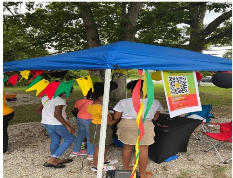
Students engaging in arts and crafts at the Alkebulan Shule table at the Business Recovery Pop Up event.