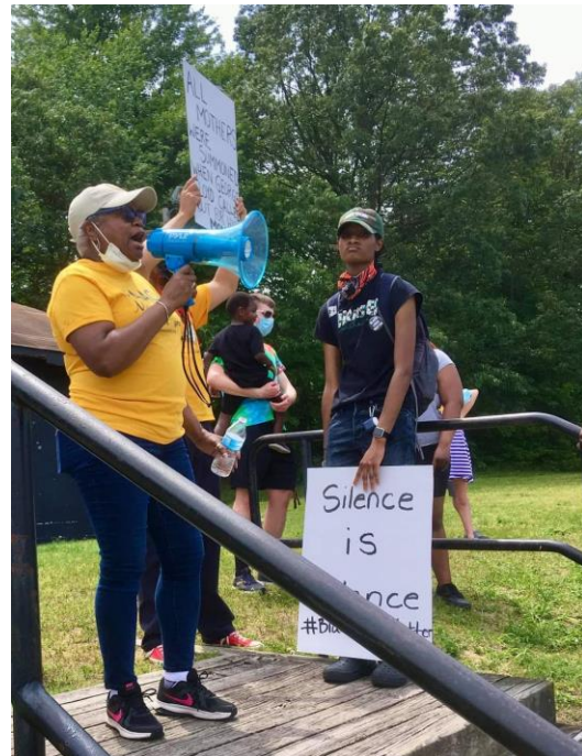
Summer 2020 – Black Lives Matter Protest

We will not stop until there is real police and judicial reform!