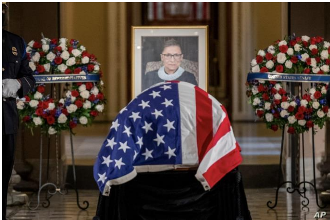
The late Justice Ruth Bader Ginsburg lies in State at the U.S. Capitol, September 25, 2020.

We are saddened to learn of the passing of U.S. Supreme Court Justice Ruth Bader Ginsburg. She was an American icon who transformed laws and policies for the betterment of society.