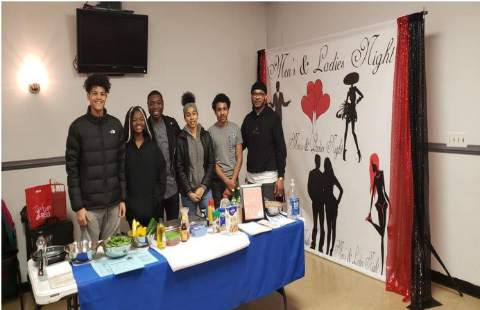
Pictured above, vendor from 6 th Annual Men's and Ladies Night

Over 100 attendees received free gifts and health education materials.