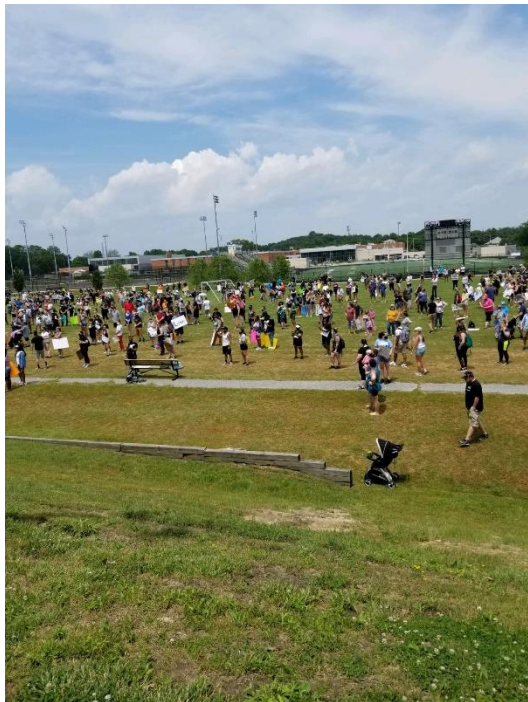
Summer 2020 – Black Lives Matter Protest

protests for Black Lives Matter in the summer of 2020. Our branch will continue to support the movement that Black Lives Matter and these important protests!