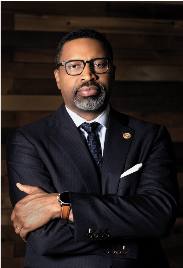
NAACP President and CEO, Derrick Johnson